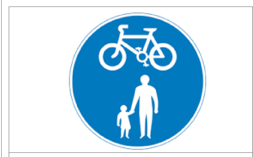
INSET C: DIAG 956 TO BE INSTALLED AT REGULAR INTERVALS ON THE SHARED USE FACILITY.

End of Footway/ Cycleway. Cyclists to rejoin main carriageway via dropped kerb.