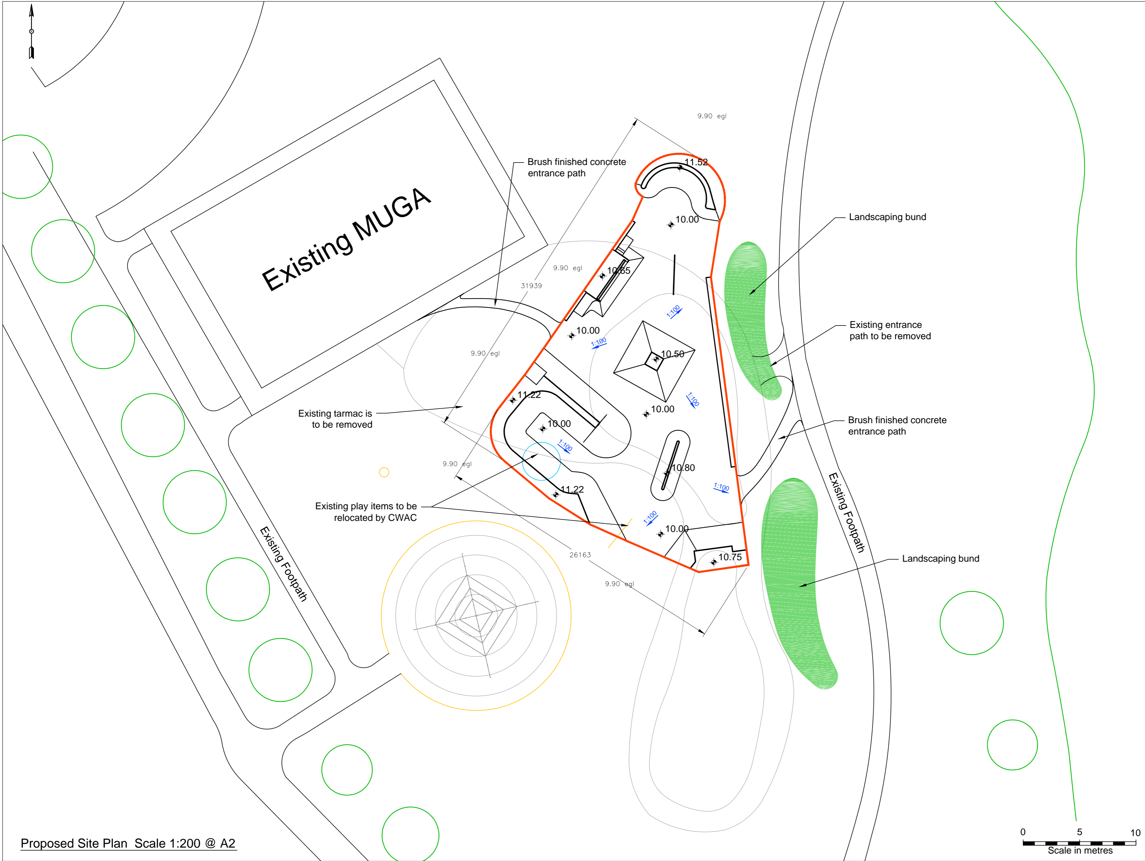
Proposed Site Plan Scale 1:200 @ A2